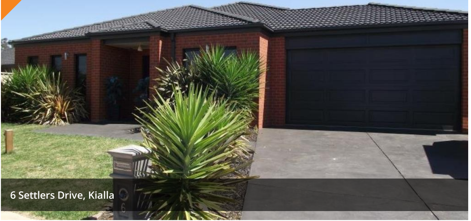
6 Settlers Drive, Kialla