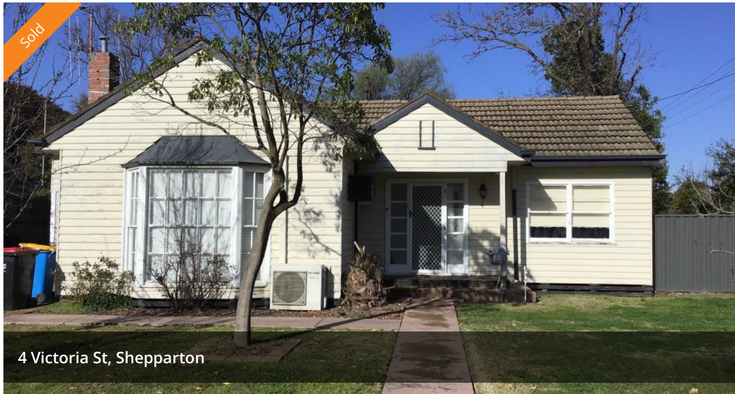
4 Victoria St, Shepparton