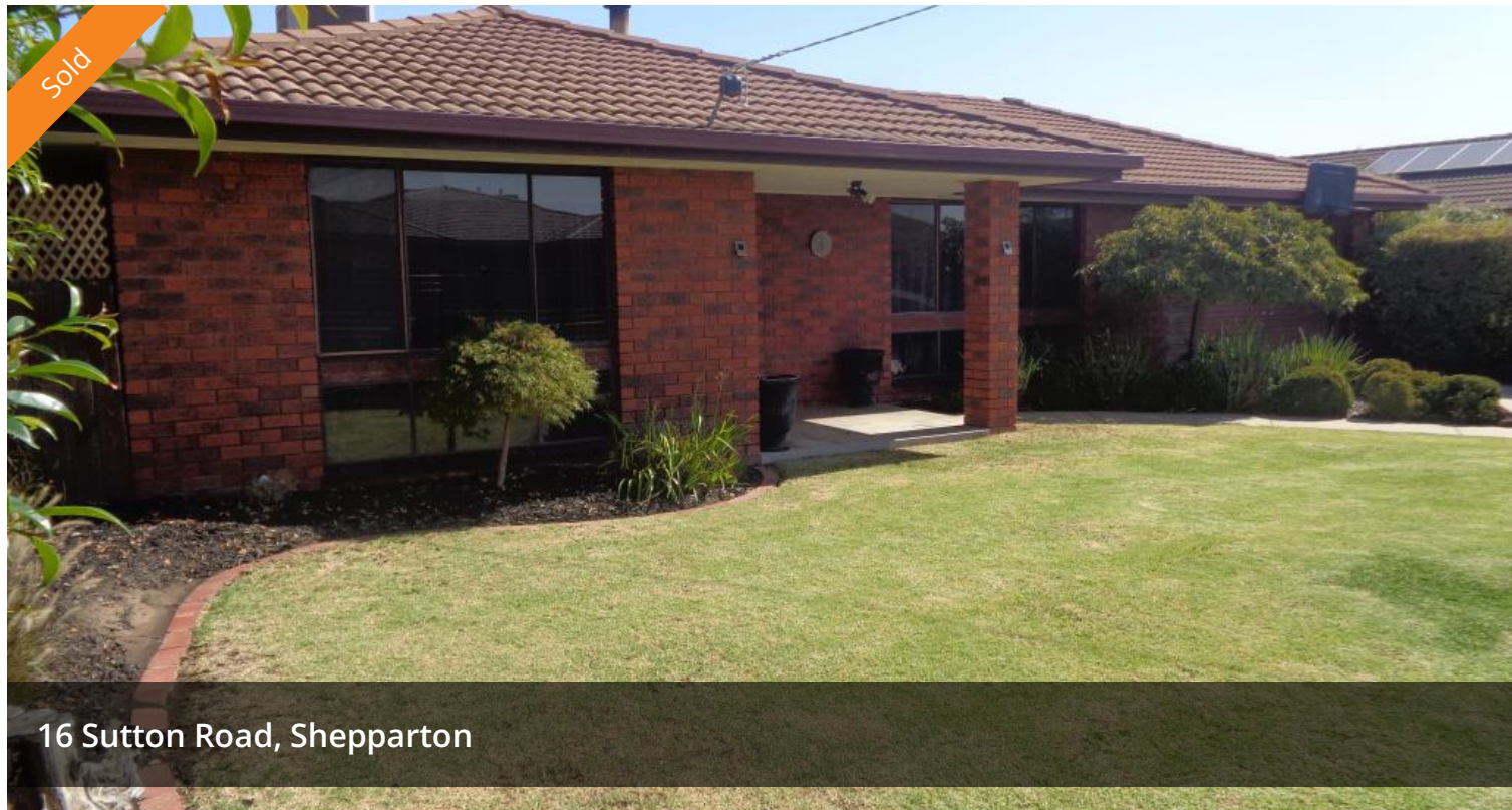
16 Sutton Road, Shepparton